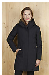
NEOBLU ALFI WOMEN 04005